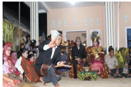
Figure 2a. The usage of sekapur sirih in customary deliberation (Daryanti, 2018).

mainly using Malay customary. Sirih pinang or Sekapur Sirih was used as a traditional means of the wedding ceremony. The use of Sirih pinang was not intended for betel-munching, but only as a customary mean as a symbol. Sirih pinang was used as a symbol that contained meaning for the community as a form of acceptance and respect. Some research on the use of sirih pinang in marriage ceremonies as a symbol of sirih pinang as a means of non-verbal communication in the habit of persuasion and engagement, to gain certainty. Sirih pinang has a deep meaning for society, the use of areca nut in any traditional ceremony, especially on the nyambai event was used as a symbol. Sirih pinang was an instrument of unisex a kinship. The following values are contained in the symbol of areca nut which can be implemented in daily life especially to build character in the young generation.