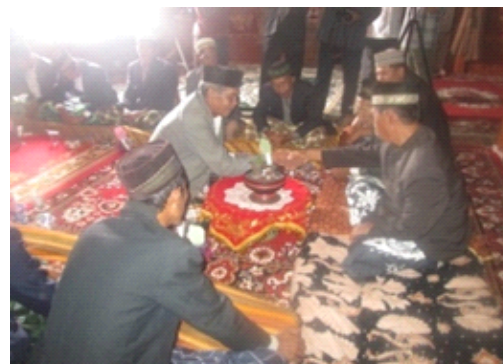
Figure 2b. The usage of Sekapur sirih in customary deliberation (Daryanti, 2018).